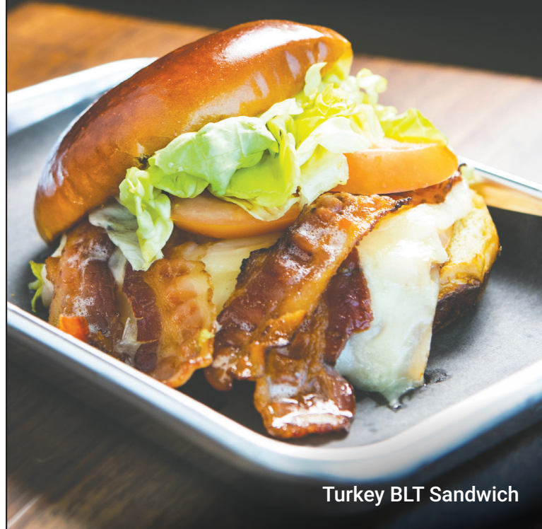
Turkey BLT Sandwich

Enjoy a variety of treats, coffees, and freshly prepared menu items — perfect for a snack break, a pick-me-up, or a quick lunch.