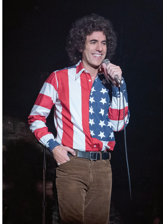
Sacha Baron Cohen stars in Netflix's The Trial of the Chicago 7 and Amazon Prime's Borat Subsequent Moviefilm .

2912 Getz Road, Fort Wayne · 260-203-9975 umifortwayne.com