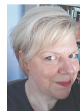
News and Venues

For more information on fees and registration, visit fort4fitness.org .