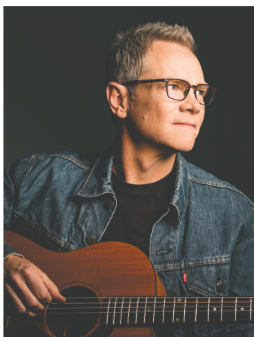
Steven Curtis Chapman

Chapman, widely recognized as the most rewarded artist in Christian music history, has released more than 25 albums during his career with ten of them achieving