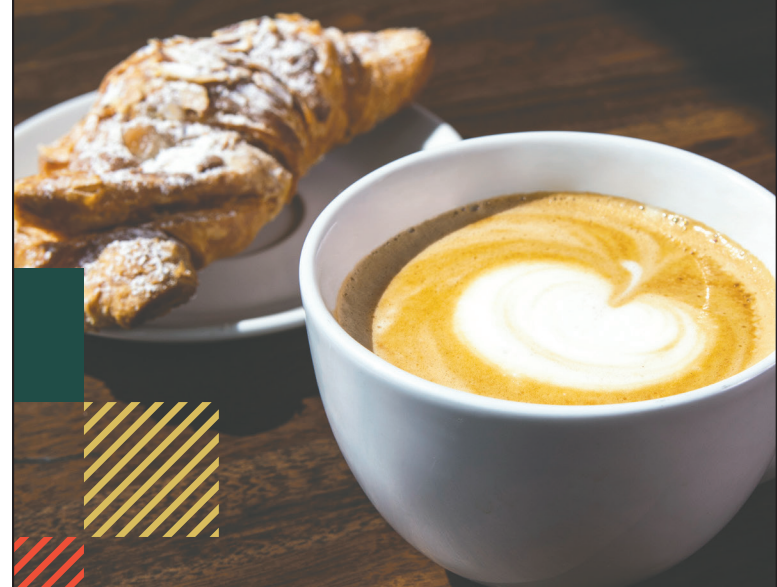
Pumpkin Spice Latte & Grace Kelly Almond Croissant

Delicious treats and drinks featuring pumpkin spice, caramel, cinnamon & more!