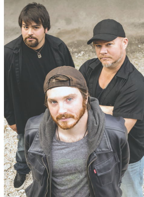
The Kickbacks are also on the docket.

Buck Lake Ranch hasn’t exactly loomed large in our collective cultural consciousness in recent years. But it was once one of Indiana’s most famous music venues. “Nashville of the North” it was called.