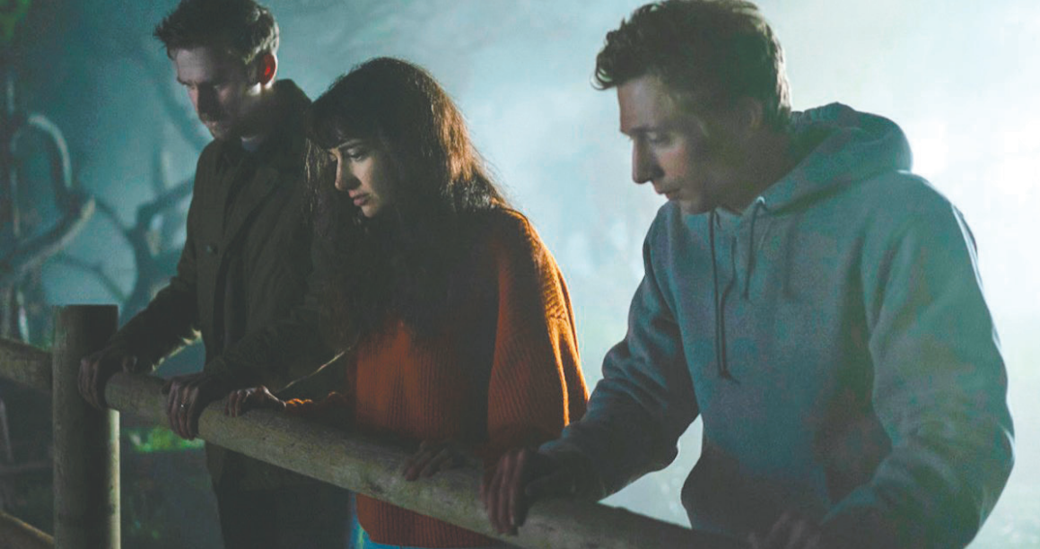
From left, Dan Stevens, Sheila Vand, and Jeremy Allen White star in The Rental .