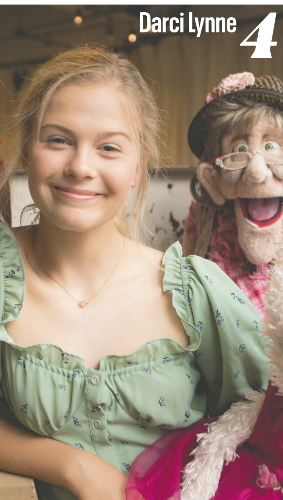
Darci Lynne 4