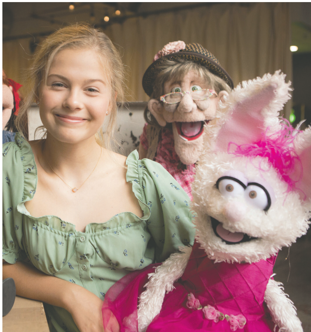
Darci Lynne Farmer

"It was hard when everybody at home was going to their first day of freshman year," she said. "It was hard to see pictures of my friends. But what I tell myself is that this is a sacrifice I've made and a lot of amazing things are happening because of that sacrifice."