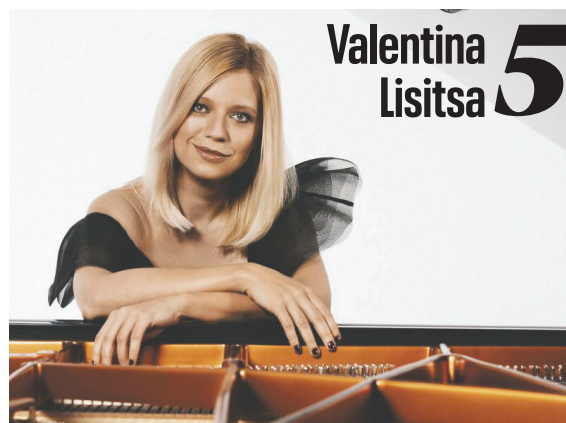
Valentina Lisitsa 5