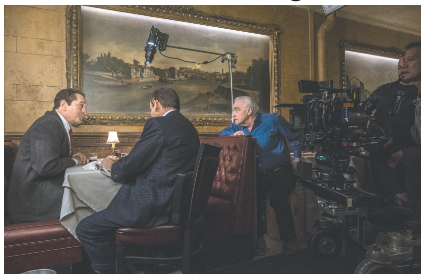
Martin Scorsese, center, directs a scene from The Irishman with actors Robert De Niro and Joe Pesci.

Florence Pugh ( Little Women ), Kathy Bates