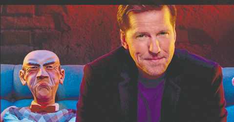
JEFF DUNHAM COMEDY AT THE EMBASSY / PAGE 10