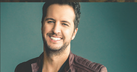
LUKE BRYAN COUNTRY AT THE COLISEUM / PAGE 8