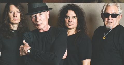
UFO ROCK AT THE HONEYWELL / PAGE 21