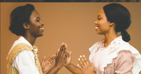
THE COLOR PURPLE MUSICAL AT THE EMBASSY / PAGE 10