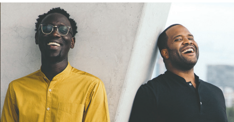
BLACK VIOLIN HIP-HOP AT THE EMBASSY / PAGE 5