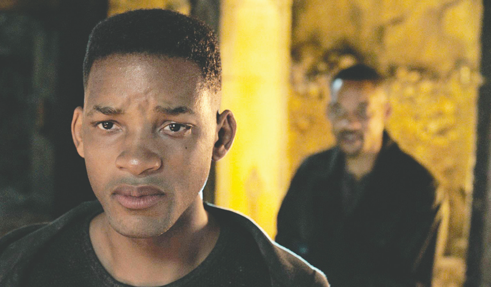
Will Smith (and Will Smith) star in Gemini Man, the new movie from director Ang Lee.