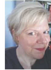
News and Venues

The games will open on Friday, April 26, with a day of sports clinics and a welcome party for athletes, coaches and families at the Plassman Athletic Center at Turnstone on North Clinton Street. The games