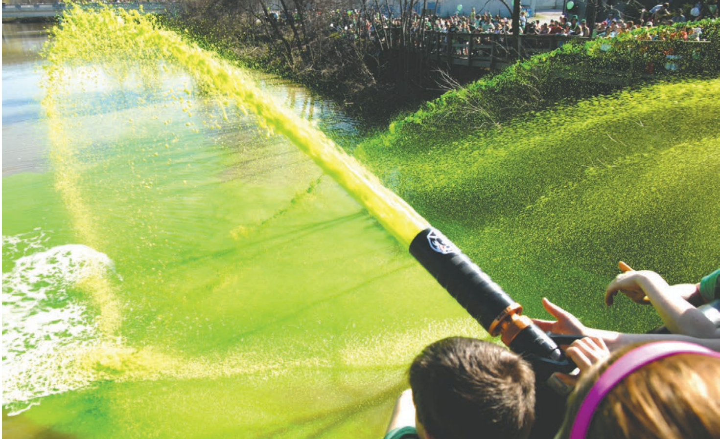
Paint the river green at downtown's Get Green Fest on Saturday, March 16.

There's a lot of fun to be had at O'Sullivan's Italian Pub on St. Patrick's Day, but don't expect a lot of what the Irish might describe as seomra uillinn : elbow room. Part of the fun of celebrating this holiday at O'Sullivan's is getting up close and personal with your fellow