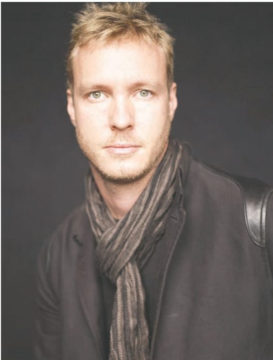
Kenny Wayne Shepherd