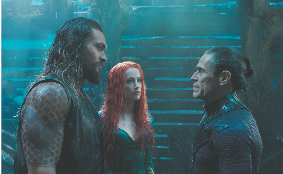
Jason Momoa, Amber Heard, and Willem Dafoe star in Aquaman , which in five weeks of release has achieved more than a billion dollars in worldwide sales.