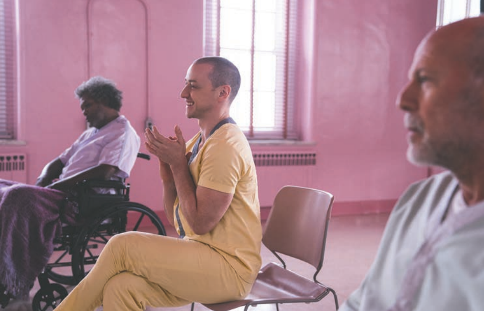
From left, Samuel L. Jackson, James McAvoy, and Bruce Willis revisit their roles in M. Night Shyamalan's films Unbreakable and Split in the sequel Glass .