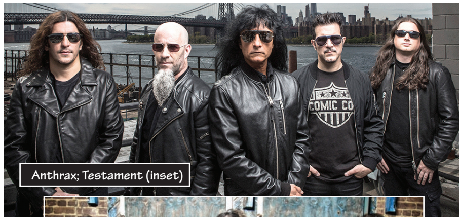
Anthrax; Testament (inset)

As one of heavy metal's Big Four — along with Metallica, Slayer and Megadeth — Anthrax helped reshape the genre in the 1980s by adding a more brutal attack and a punk sensibility. To that basic template Anthrax add a strong melodic sense in a way that distinguishes the band from its contemporaries.