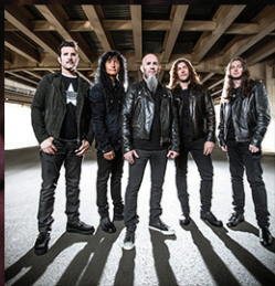
ANTHRAX PAGE 4

Northern Indiana Bluegrass Festival Sidewalk Prophets Cherry Blossom Festival Art & Entertainment Calendars Music & Movie Reviews Pinocchio