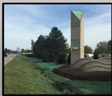
CITY ON THE MOVE PAGE 4

ALSO INSIDE MUSIC & MOVIE REVIEWS ART & ENTERTAINMENT CALENDARS