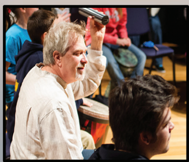
SWEETWATER DRUM CIRCLE PAGE 2