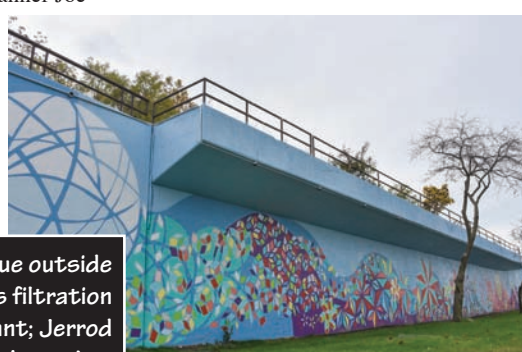
Statue outside city's filtration plant; Jerrod Tobias' mural on Columbia Avenue

cannot boast of nearby natural wonders, she said, it is especially important to find different ways to tell the city's story.