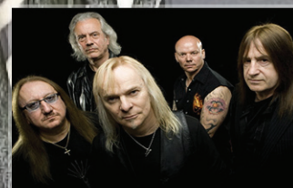
URIAH HEEP // PAGE 5