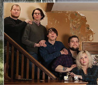
THE SNARKS // PAGE 6