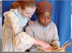
Young Harriet Tubman Page 7