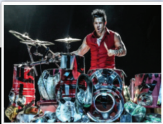
Recycled Percussion Page 6