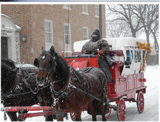
Winterval Page 4