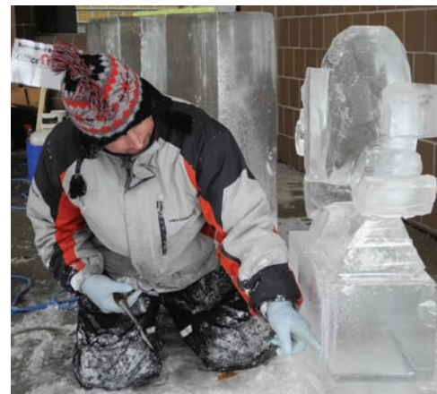
WINTERVAL 2018 Saturday, January 27 Downtown Fort Wayne