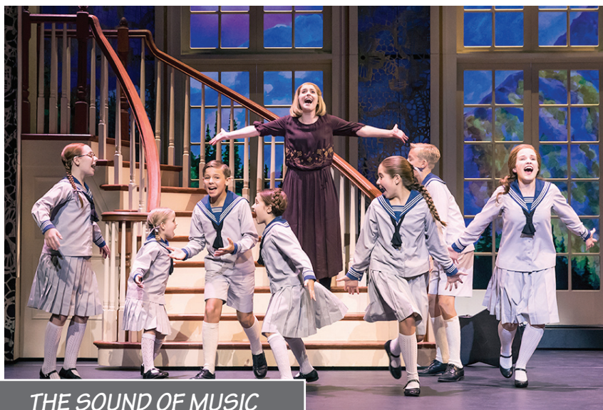
THE SOUND OF MUSIC 7:30 p.m. Wednesday, Jan. 17 Embassy Theatre 125 W. Jefferson Blvd., Fort Wayne Tix: Sold Out

tin because, as Andrews learned herself just a year or so earlier, Broadway success hardly guarantees landing the film. Edged out of her star-turning role as Eliza Doolittle in My Fair Lady (with Audrey Hepburn filling the part), Andrews went on to make Mary Poppins that same year, earning an Academy Award for her efforts. Having proven herself on the screen, it was now she who edged out Martin for a plum musical part. Fate's a remarkable thing.