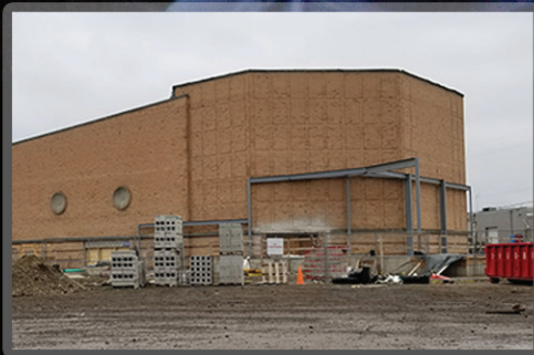
CLYDE THEATRE PAGE FIVE