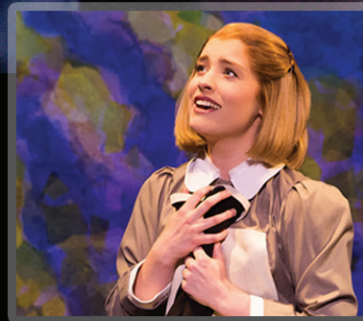
THE SOUND OF MUSIC PAGE SIX

FACEBOOK.COM/WHATZUPFTWAYNE WWW.WHATZUP.COM