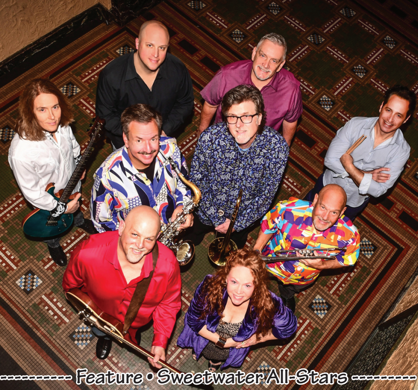
Feature • Sweetwater All-Stars