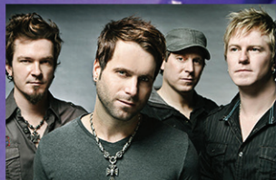
PARMALEE PAGE 5