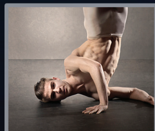
A Dancer's Legacy Fort Wayne Ballet Page 6