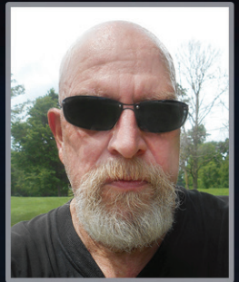
Artist Gregg Coffey Page 8