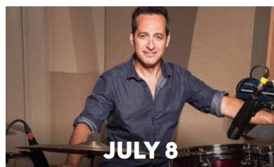
JULY 8 Recording Drums Workshop featuring Nick D'Virgilio