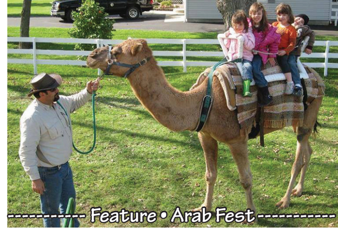
-----Feature • Arab Fest-----

"It's pretty cheap to live in Illinois. We can afford to tour and have a house so that we can get together to practice and not have to rent a space somewhere. It can sometimes be hard to find musicians or find places to play locally in a smaller area, but we're also so close to so many other places."