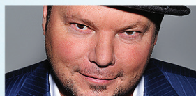
CHRISTOPHER CROSS PAGE 5