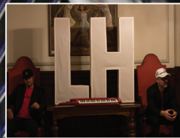
Love Hustler Page 6