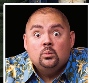
GABRIEL IGLESIAS PAGE 5