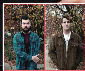
SHADE PAGE 6

ALSO INSIDE MUSIC, MOVIE & BOOK REVIEWS • ART & ENTERTAINMENT CALENDARS • MORE