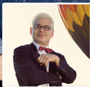
PINK MARTINI PAGE 4