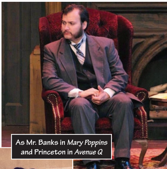
As Mr. Banks in Mary Poppins and Princeton in Avenue Q