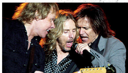
Styx Page 5