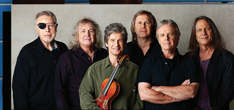
Kansas Page Six