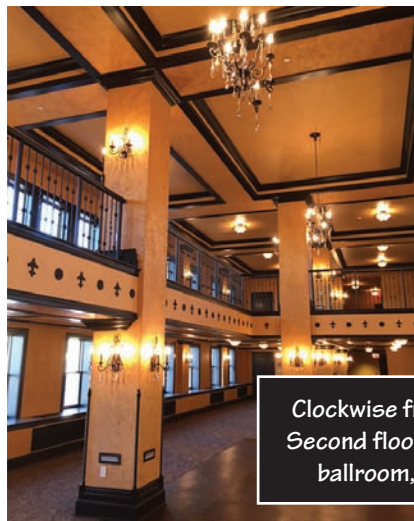
Clockwise from top: Second floor lounge, ballroom, rooftop