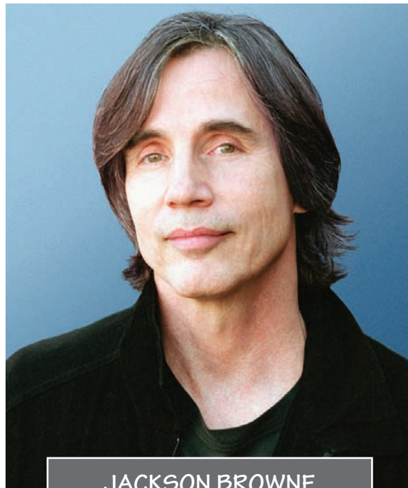
JACKSON BROWNE w/LARRY CAMPBELL & TERESA WILLIAMS

At 67, Jackson Browne retains not only the same enthusiasm and attention to detail he had when his eponymous debut hit the streets in 1970, he still has the same hair. He’s like a modern-day Dorian Gray without the character flaws. If Jackson Browne is still running on empty, he’s not showing it.