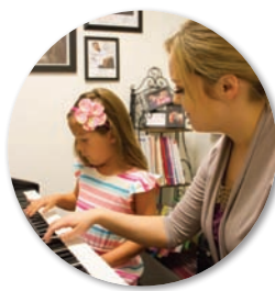
Friendly and Experienced Instructors