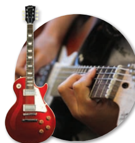
Lessons for All Ages and Skill Levels