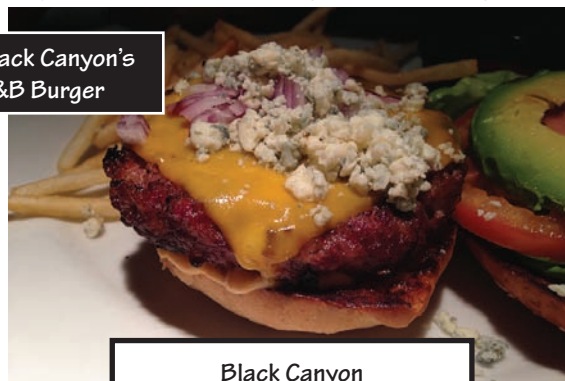
Black Canyon's B&B Burger

Black Canyon 1509 W. Dupont Rd. Fort Wayne 260-203-5900