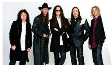
Hotel California Page Eleven