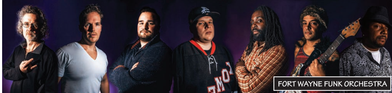
FORT WAYNE FUNK ORCHESTRA