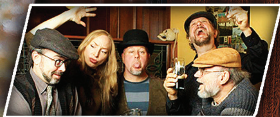
The Mighty McGuiggans