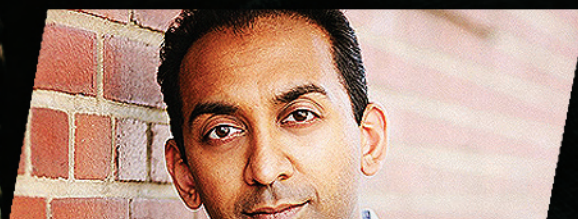
HOLIDAY POPS PAGE 6

ALSO INSIDE DIXON & MCRAE BAREFOOT IN THE PARK ENTERTAINMENT CALENDARS MEDIA REVIEWS & MUCH MORE