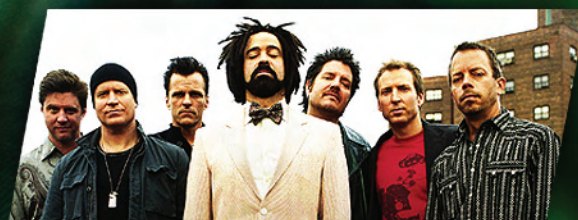
COUNTING CROWS PAGE 4