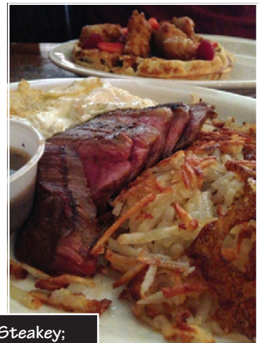
CS3's Eggs & Steak; Joseph Decuis' Wagyu Burger

On our first trip, we tried the BBQ Pork Banh Mi and the Wagyu Burger. Both were prepared perfectly. The BBQ Pork Banh Mi was packed with the per-