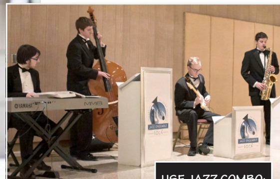
USF JAZZ COMBO; TUNE FANCY