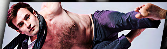
KEIGWIN + COMPANY PAGE SIX