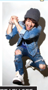
THE READY SET

This dreamy heartthrob will be accompanied this Friday by Outasight, and will tour this fall with well-known groups The All-American Rejects and Boys Like Girls.