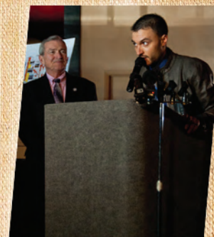
CLYDE THEATRE PAGE 6