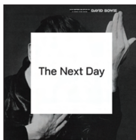
The Next Day

These guys can't sing. I love it. The best rock vocalists are limited. Bob Dylan can't sing worth a lick. Kurt Cobain was all style. Even Bob Pollard, according to some listeners, spent most of the 90s affecting a British accent to cover up whatever midwestern Ohio lingered in his voice. The phrasing is at times a bit awkward — they