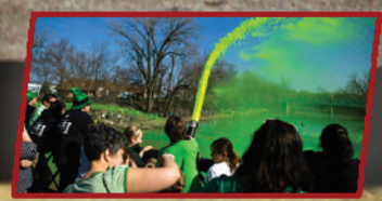
ST. PATRICK'S DAY WEEKEND STORY ON PAGE 5

MORE ONLINE WWW.WHATZUP.COM FACEBOOK.COM/WHATZUPFORTWAYNE