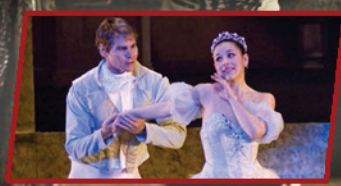
FORT WAYNE BALLET'S CINDERELLA STORY ON PAGE 8