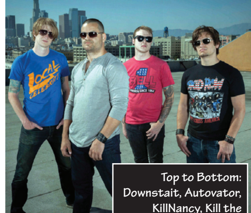
Top to Bottom: Downstait, Autovator, KillNancy, Kill the Rabbit & I, Wombat