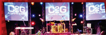
C2G MUSIC HALL