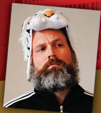
SANKOFA PAGE 6

NEW AMERICAN YOUTH BALLET'S THE NUTCRACKER OUT + ABOUT THE FINAL HURRAHS ENTERTAINMENT CALENDARS SCREENTIME MUSIC, MOVIE + BOOK REVIEWS MOVIE TIMES + MUCH MORE