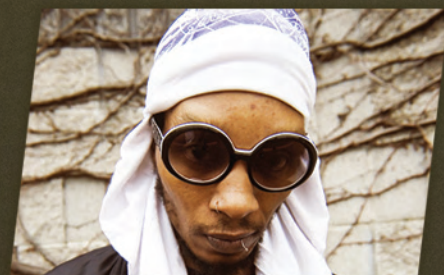
PAGE SIX DEL THE FUNKY HOMOSAPIEN