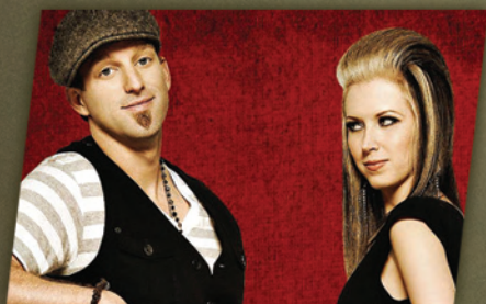
THOMPSON PAGE SQUARE FIVE