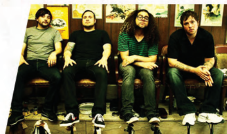
COHEED & CAMBRIA PAGE 6