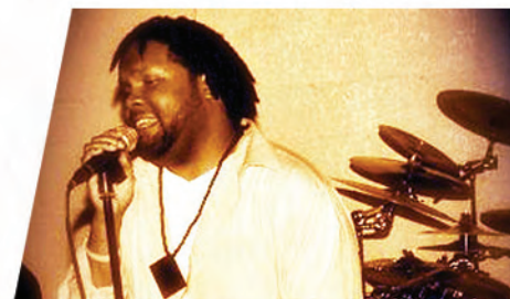
MOMMA AIN'T HOME PAGE 7