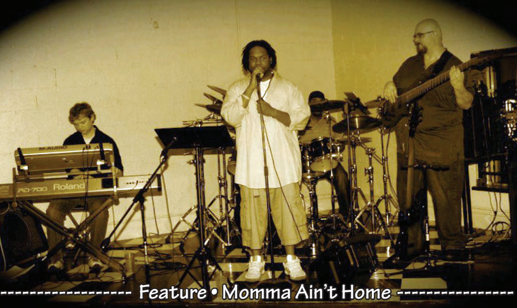
Feature • Momma Ain't Home