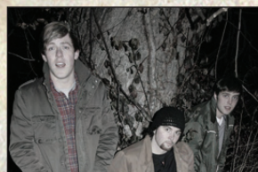
10:40 pm FAIR FJOLA 11:30 pm SLOW POKES