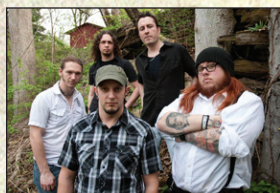
9:00 pm BIG MONEY AND THE SPARE CHANGE 9:50 pm VALTALLA