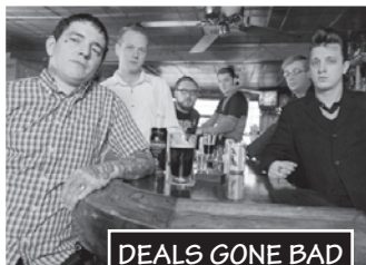
DEALS GONE BAD