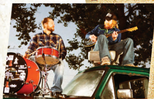
LEFT LANE CRUISER