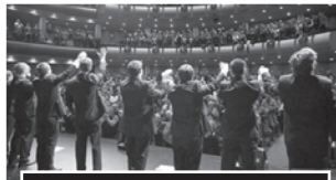
STRAIGHT NO CHASER