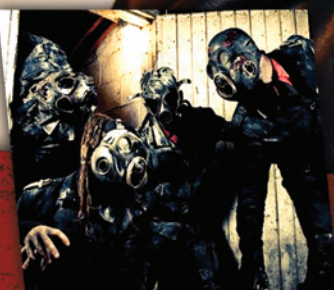
VENTANA PAGE FIVE