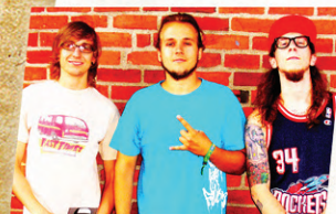
ELEPHANTS IN MUD