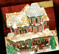
FESTIVAL OF GINGERBREAD PAGE FIVE