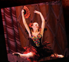
THE NUTCRACKER PAGE FIVE