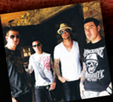
AVENGED SEVENFOLD PAGE SIX