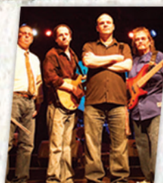
JUKE JOINT JIVE PAGE 6