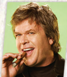
RON WHITE PAGE 5