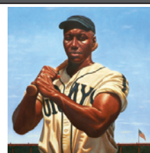
Josh Gibson (2006) Kadir Nelson, oil on canvas From the artist's collection

311 East Main Street, Fort Wayne 260-422-6467 • www.fwmoa.org