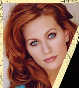
APRIL MACIE PAGE 6

ENTERTAINMENT CALENDARS CD, DVD + BOOK REVIEWS ROAD NOTEZ MOVIE TIMES + MUCH MORE!