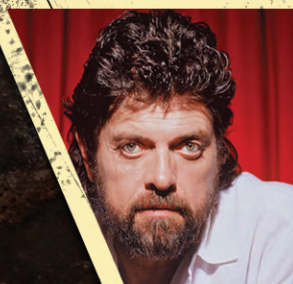
ALAN PARSONS PAGE 6

OUT + ABOUT THE NAKED VINE DINING IN THE TIMEKEEPER