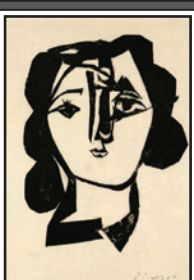
Pablo Picasso • Lithograph Tete de Femme, 1945 Collection of the Fort Wayne Museum of Art