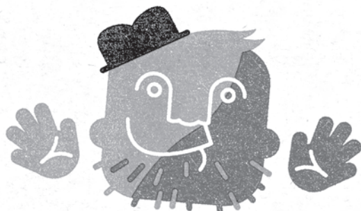
fig.3, the fortissimo