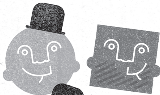
fig.1, the encounter

A SYMPHONIC COLLISION OF THE PRECISE AND THE UNBOUND